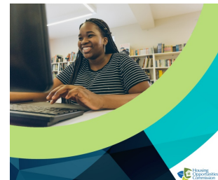
EDUCATIONAL OPPORTUNITY CENTER INFORMATION SESSION

Register for the EOC Information Session Here