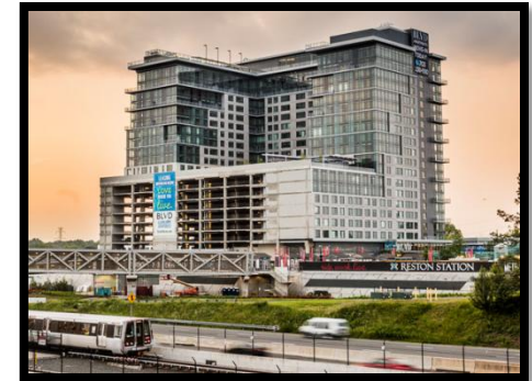
Reston Station (Called BLVD )