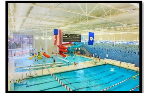
Smith Aquatic Center (VA)