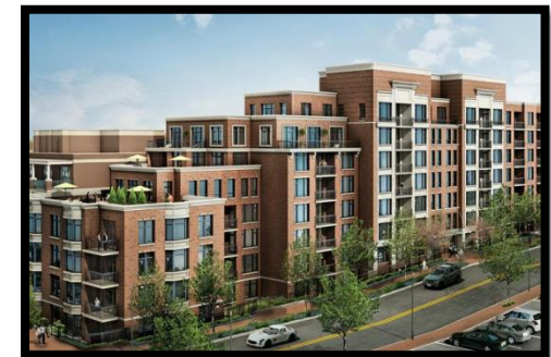
Hampden Row Condominiums