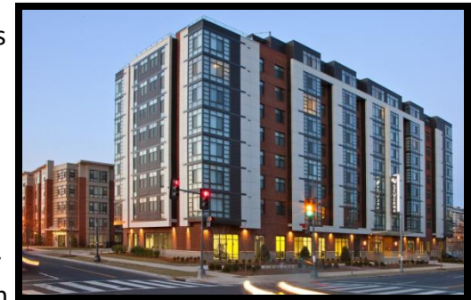
Severna Phase I and II