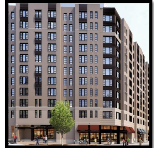
The Bonifant at Silver Spring